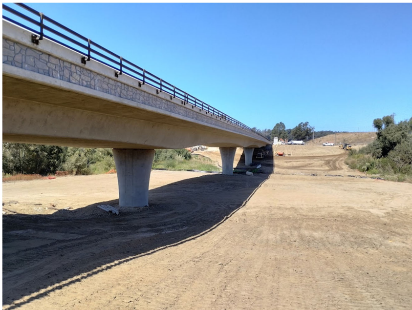
Figure 3 Bridge No. 51C0006 Floradale Ave Bridge over Santa Ynez River AFTER