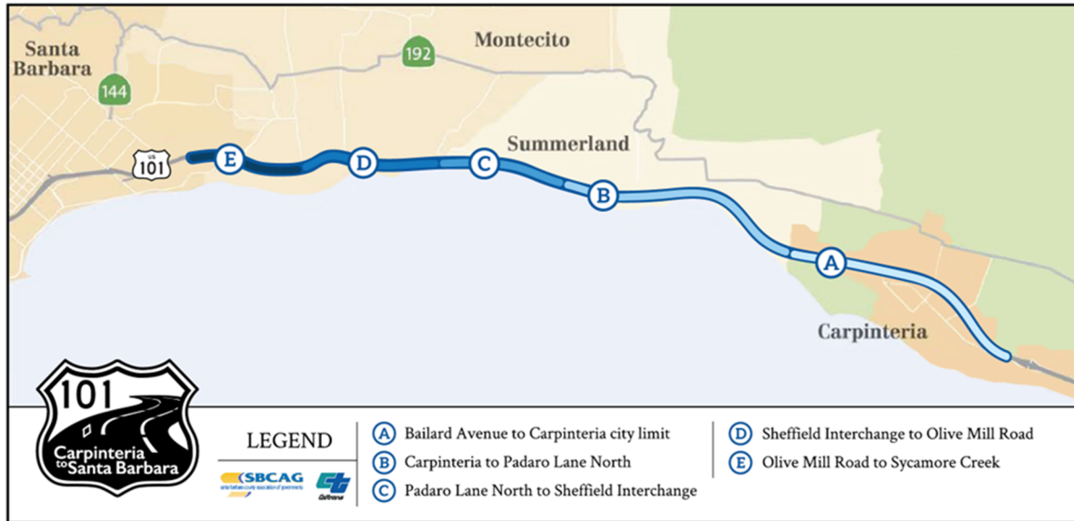
Figure 3 South Coast 101 HOV Carpinteria (Segment 4A-4E)

A key project that is making progress towards achieving PM 3 target is South Coast 101 HOV Carpinteria (Segment 4A) (MPO ID: CT123). This project serves to improve NHS performance and interstate freight movement.