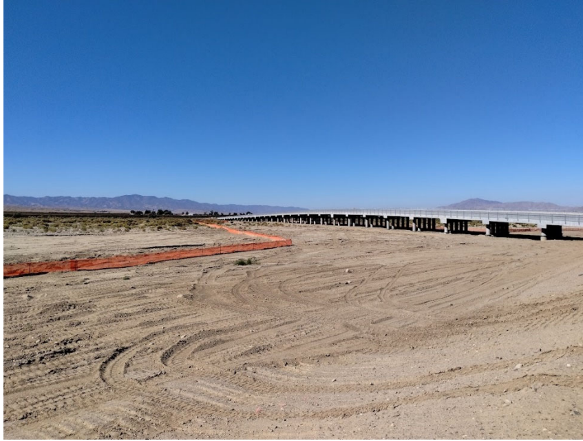
Figure 2 Foothill Road Bridge over Cuyama River project Bridge No. 00L0047 AFTER