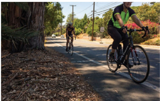
Figure 1 Existing Conditions of Modoc Road Multimodal Path project

A significant Active Transportation Program (ATP) project is Modoc Road Multimodal Path Gap Closure project (MPO ID: COUNTY33), which will construct 1.1 miles of Class I (multi-use) path along Modoc Road for bicyclists, runners and pedestrians of all ages and abilities. This project is part of a much larger transformative project that crosses the Santa Barbara County/City line and connects to the City of Santa Barbara’s ATP Cycle 3 project, Las Positas/Modoc Road Multiuse Path Project, which is now complete. See picture below showing existing conditions.