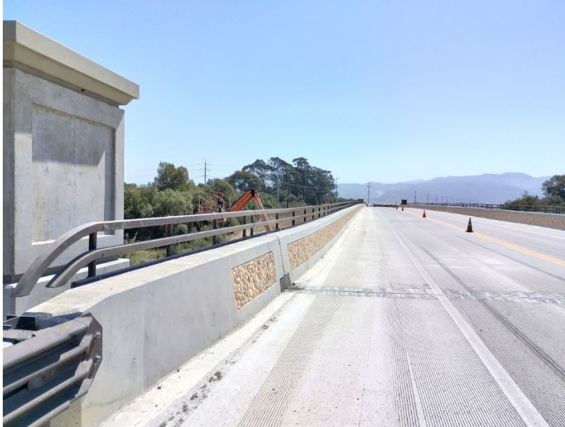
Figure 4 Bridge No. 51C0006 Floradale Ave Bridge deck